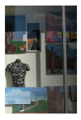
Marist College Ashgrove Performing Arts Centre