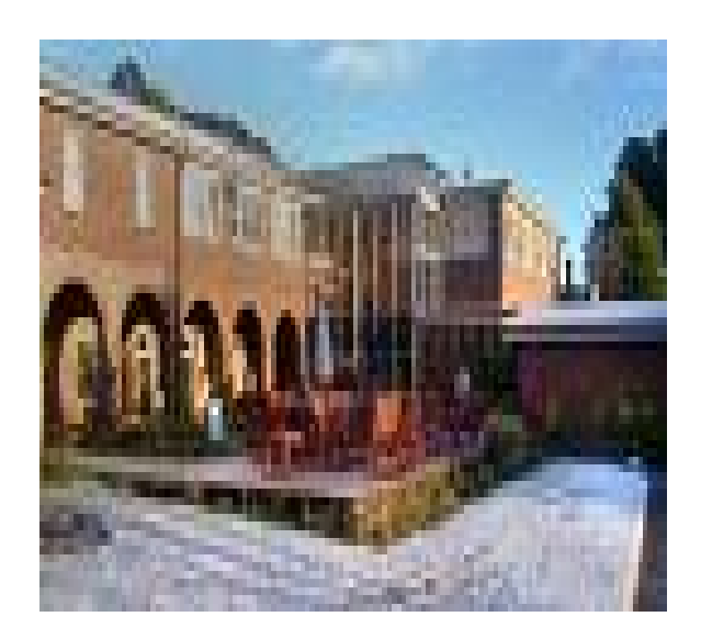
The Hermitage, Mittagong, New South Wales, Australia